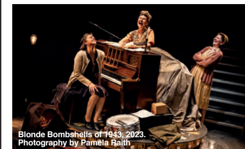
Blonde Bombshells of 1943, 2023.

For every Theatre by the Lake brochure we also produce a corresponding Audio Brochure available to listen to online. For more information on our audio brochures please email enquiries@theatrebythelake.com .