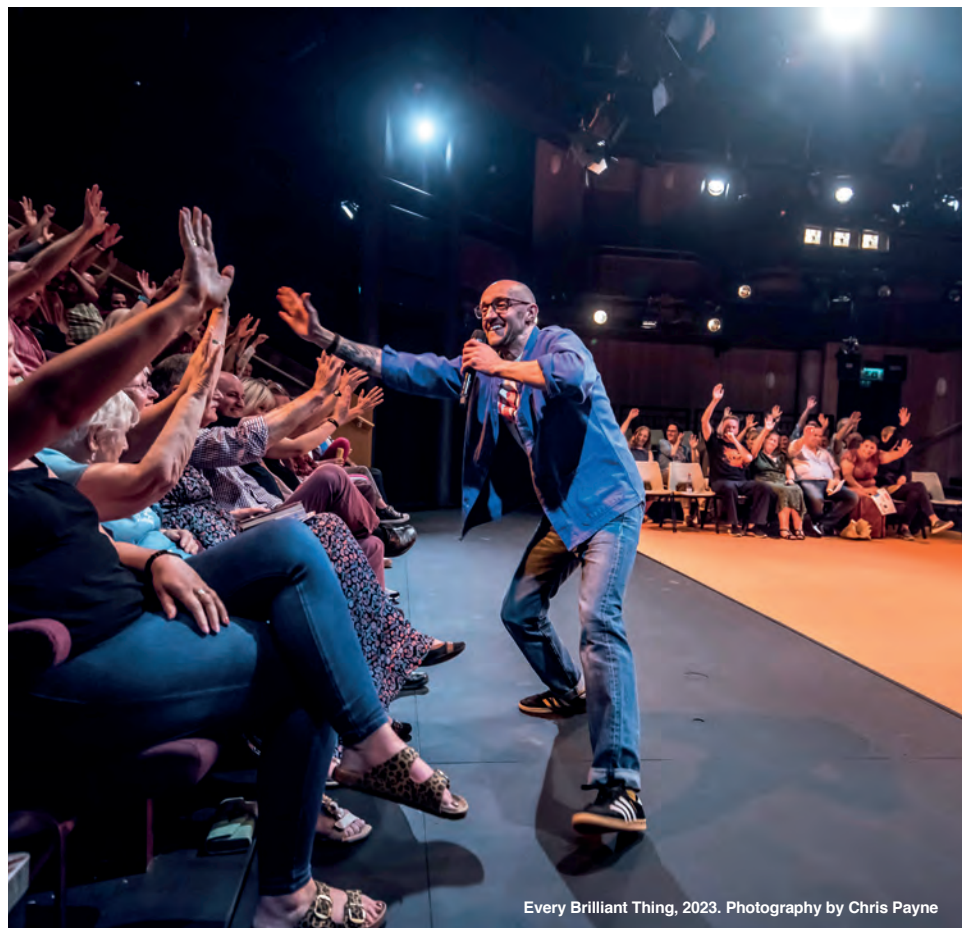
Every Brilliant Thing, 2023.

Theatre by the Lake was willed into existence by the community in 1999 from a major campaign by theatre lovers across Cumbria and further afield. From our idyllic location on the banks of Derwentwater, we bring the world to Cumbria and Cumbria to the world through the magic of live theatre, opportunities to get involved and supporting Cumbrian artists to develop their skills.