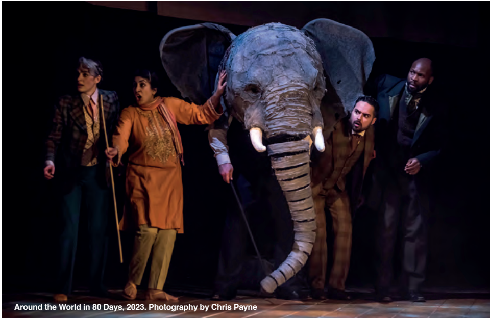
Around the World in 80 Days, 2023.