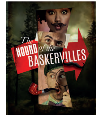
The Hound of the Baskervilles 9 Aug - 7 Sep

Season Saver Deals are only available for Band 1 and Band 2 tickets (see page 4 for further information on ticket bands).