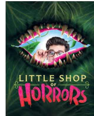
Little Shop of Horrors 27 March - 20 April