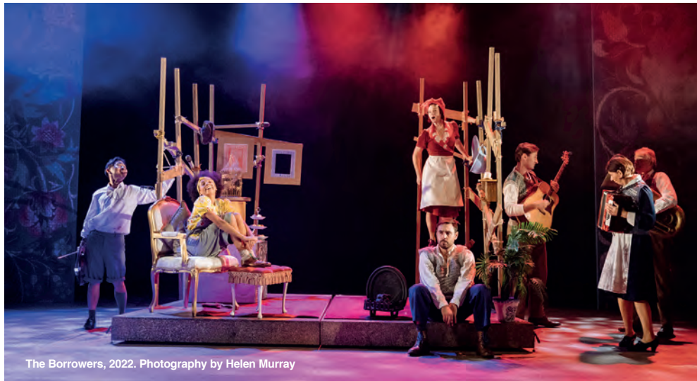
The Borrowers, 2022. Photography by Helen Murray