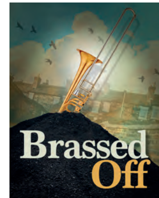
Brassed Off 28 June - 27 July