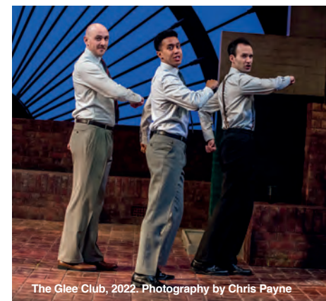
The Glee Club, 2022.