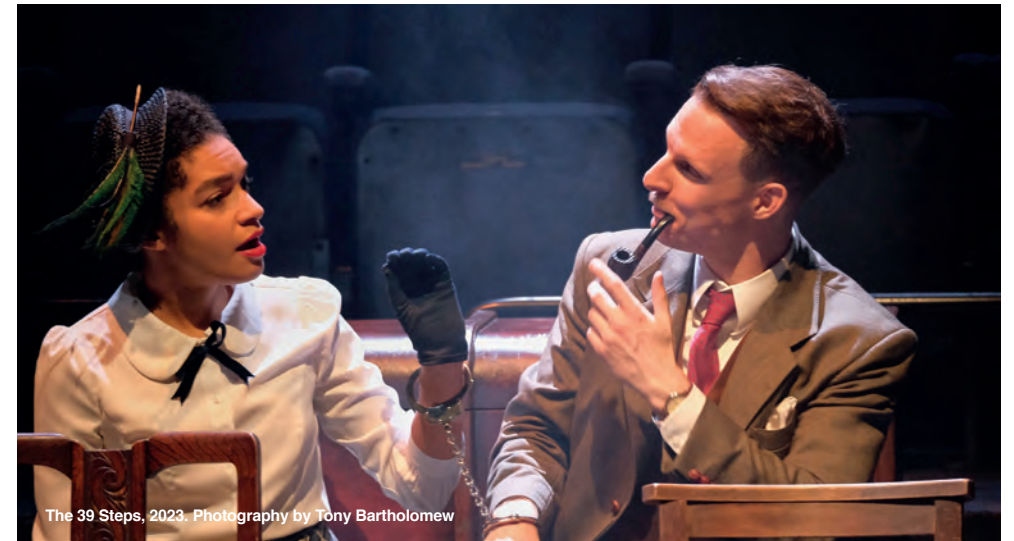
The 39 Steps, 2023.

Supported using public funding by ARTS COUNCIL ENGLAND