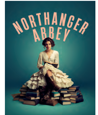
Northanger Abbey 27 April - 17 May