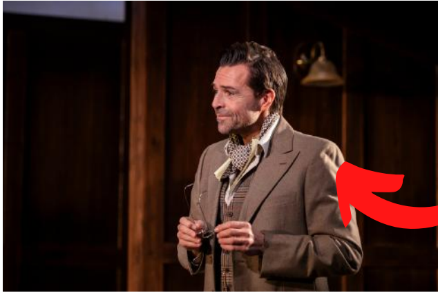
Captain William Crewe

(played by the same actor as Charles Dufarge).