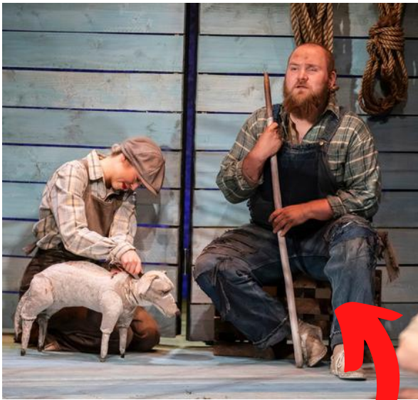
Candy and his dog

Candy was in an accident on the ranch which left him blind. He can't really work anymore but the boss keeps him on as a cleaner. He has an old dog.